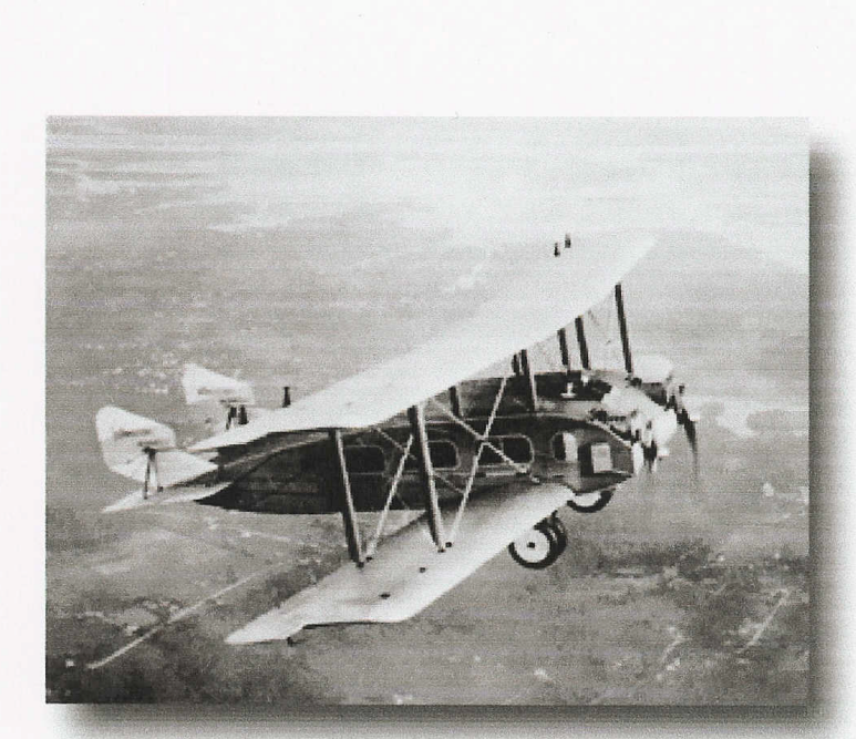
1921 - Long Island, NY Burnelli RB-1 -- the first lifting-body reduced to practice.