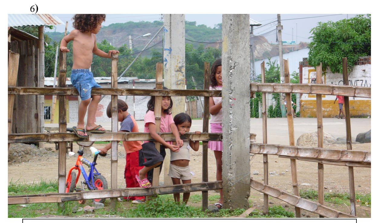
A group of street children play on a bamboo fence on a hot January day. Photo taken January, 2007