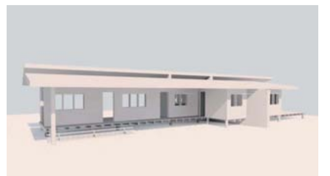
Unexpanded Jamaica House- North Elevation

In Jan Wampler's Jamaica House Workshop, a design for a single-family house was created for Habitat for Humanity. The initial square footage requirement was 280, and expansion up to 800 square feet had to be allowable. Although the design focus was on meeting those requirements, basic ideas of natural ventilation were incorporated from the beginning with inspiration from Glenn Murcutt's Marika Alderton house. A long, narrow elevated plan was developed with extensive louvred windows. However, as the criteria for this standard were developed further, modifications were made to the design, such as the reduction of a concrete wall, the off-setting of the roofs for ventilation through clerestory windows, and the expansion