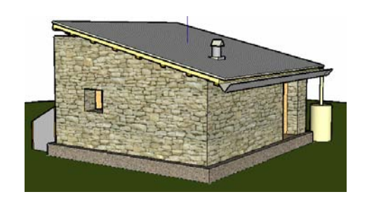
Fig1. CGI shelter

Image removed due to copyright restrictions.