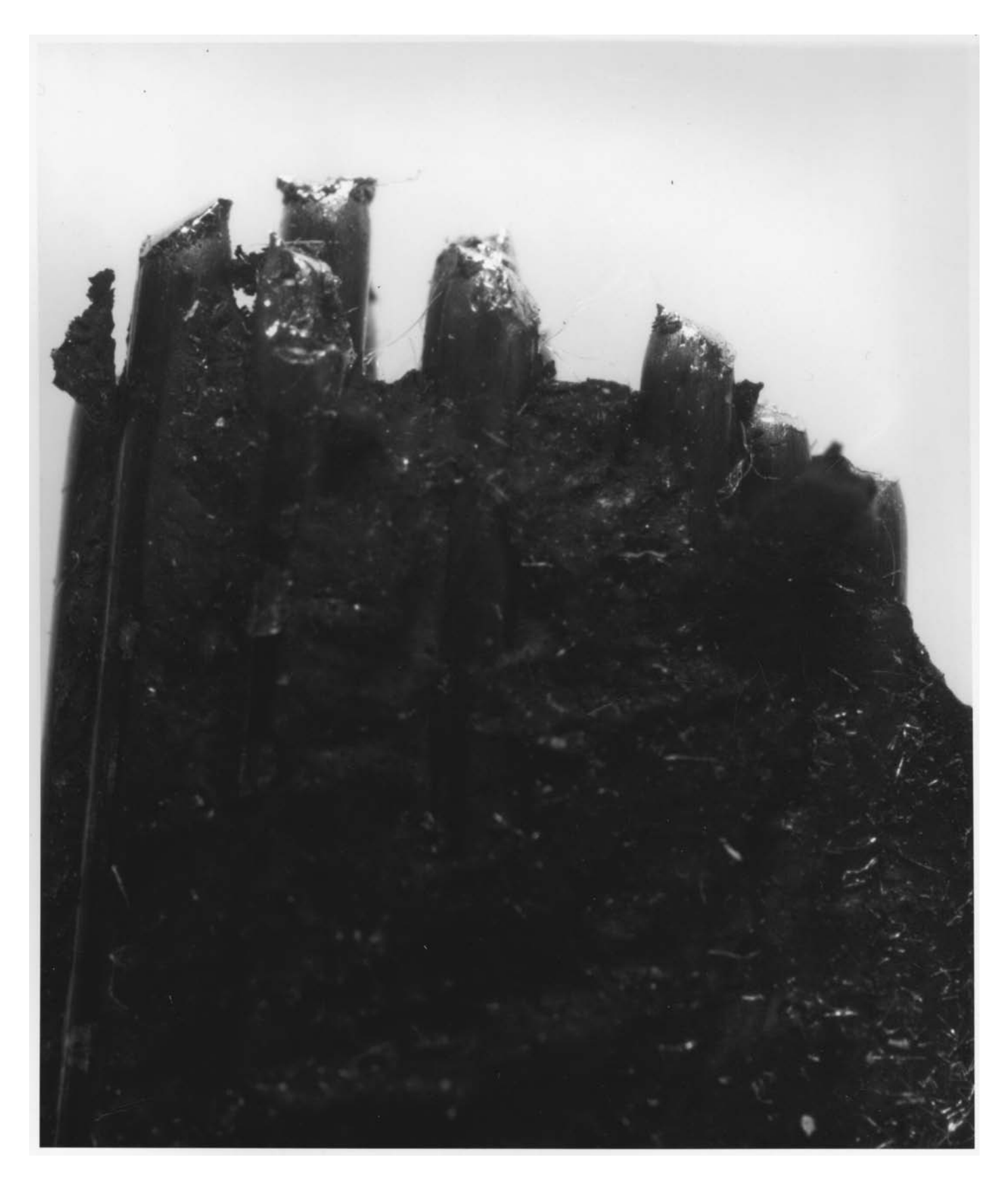
Figure 4: Side view of bead wires, showing ductile fracture.