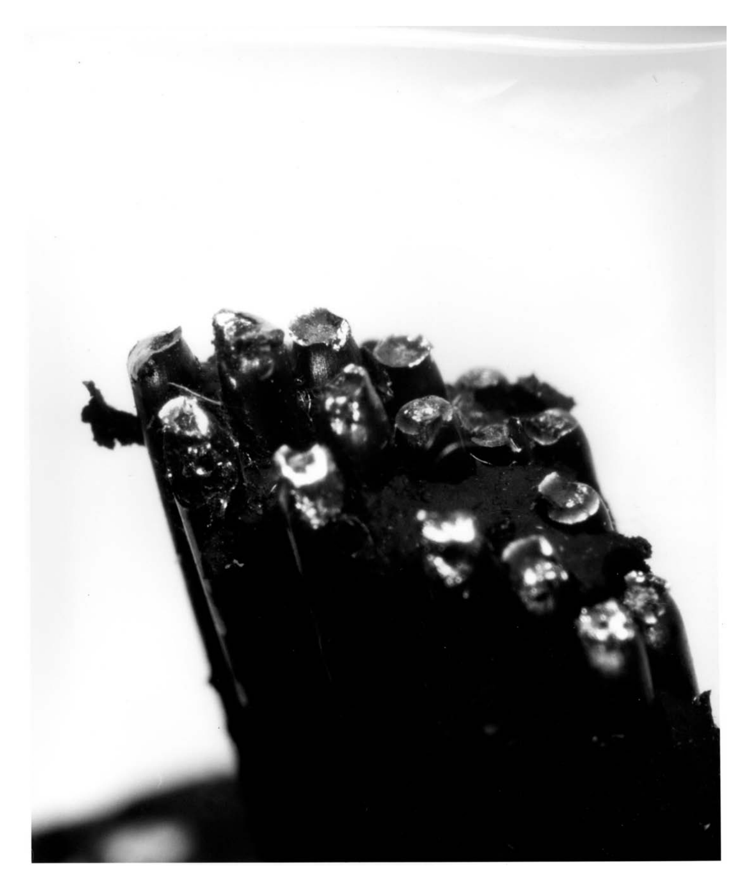
Figure 2: View of bead wires, showing ductile fracture.