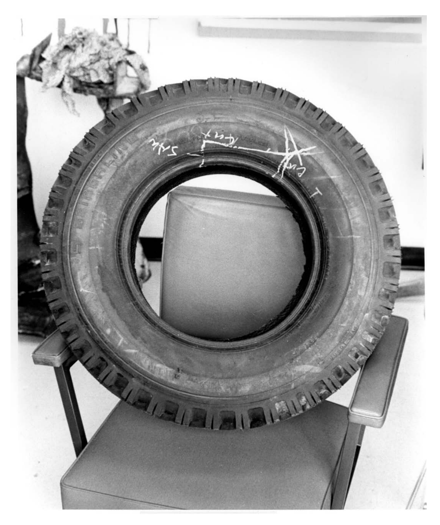
Figure 1: Subject tire, as received.