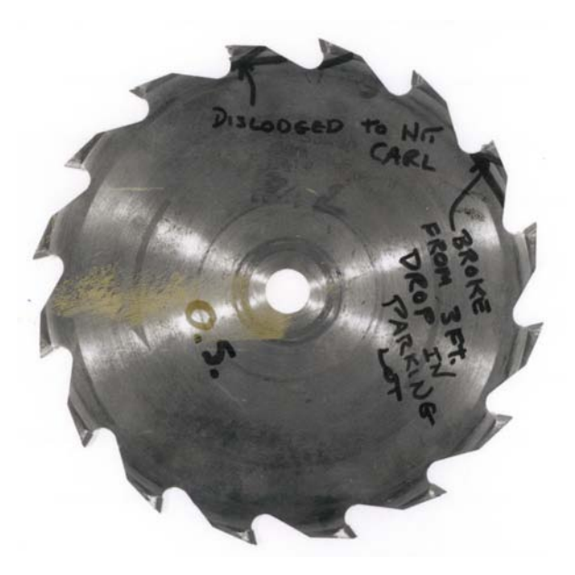
Figure 2: Subject blade, showing multiple broken teeth.