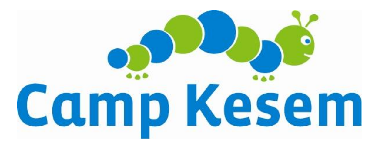
Figure 3: Camp Kesem Logo The blue and green caterpillar is now a national symbol that unifies all local chapters.

counselors felt that the sense of security fostered at Camp Kesem was too valuable. Ultimately, pranks were banned in the next year of camp to maintain trust among counselors and campers. Symbols