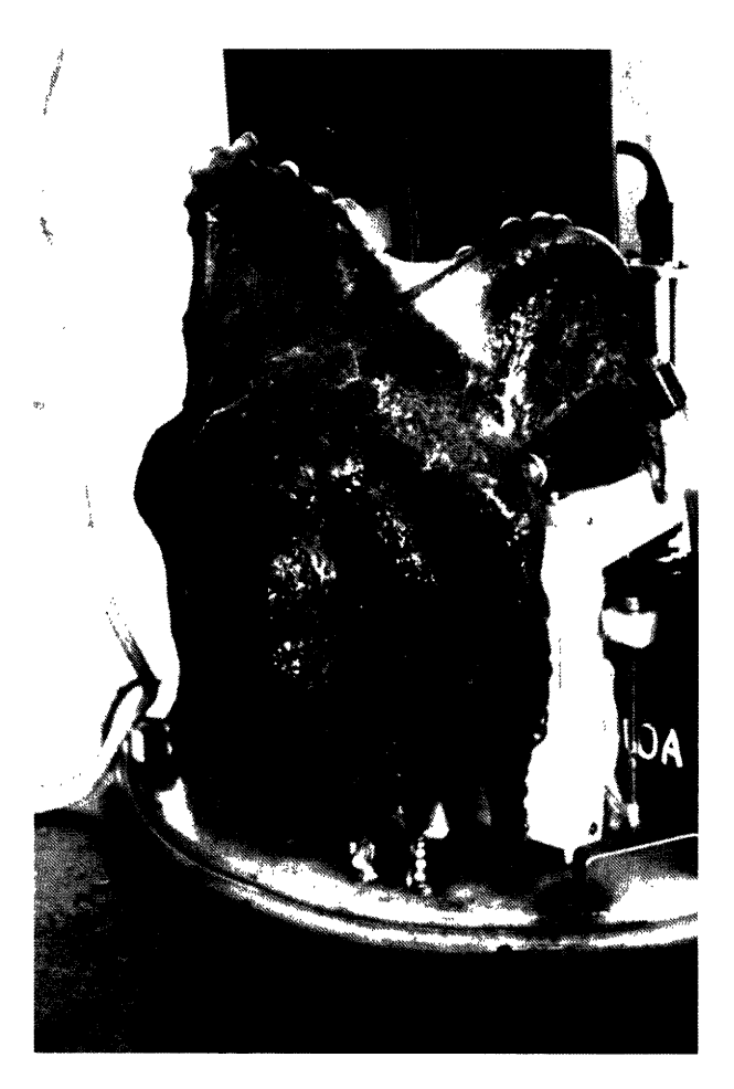
Figure 14.1 Octopus attached to sensor area of University of Washington bottom pressure gauge brought up from 500-m depth, north side of Drake Passage, 1977.

There are two threads that our "good and determined" engineers have followed in order to bring us up to the modern state of ocean instrumental engineering.